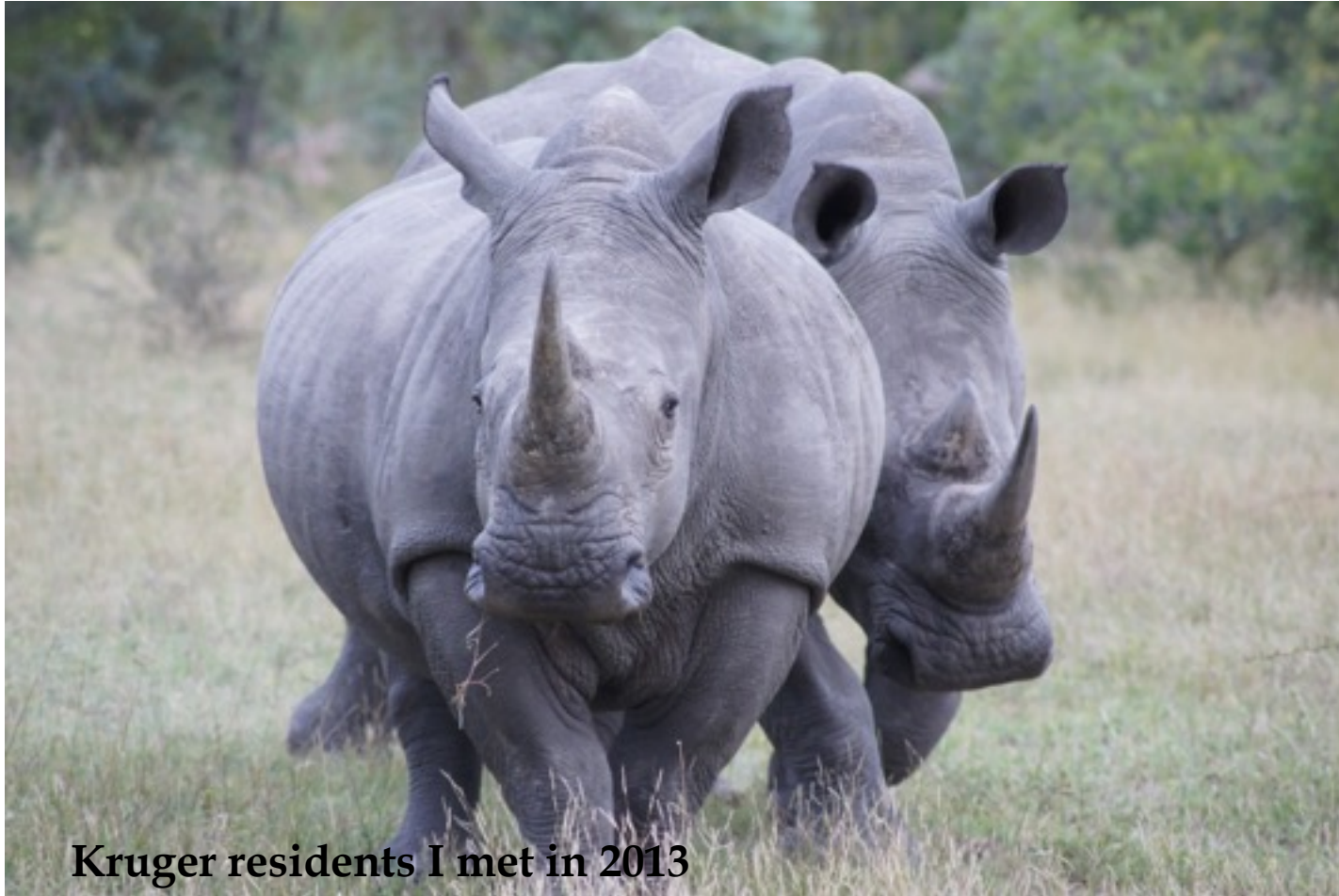
Kruger residents I met in 2013